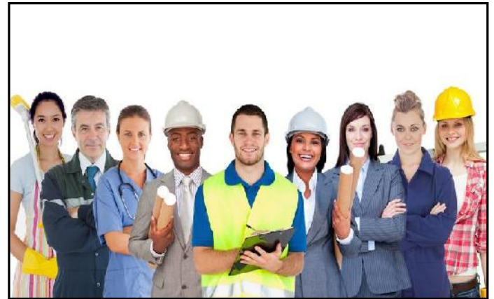
Raleigh #1 Job Market in U.S. by Glassdoor