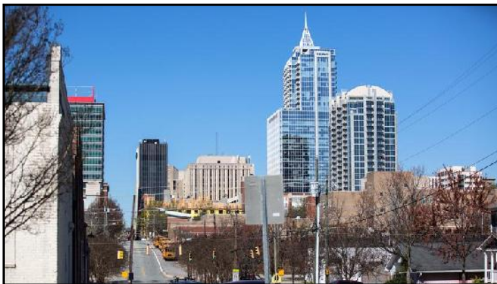
NC #2 in Business & Careers as ranked by Forbes