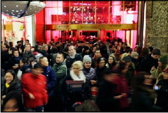
U.S. Holiday spending poised to be highest since 2007